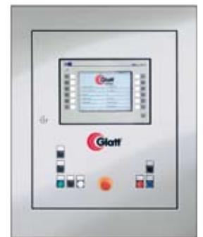
Operating panel EcoView