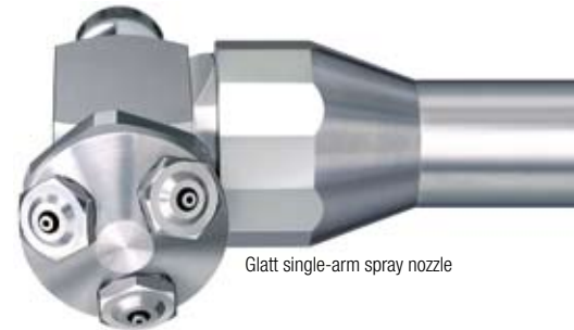
Glatt single-arm spray nozzle